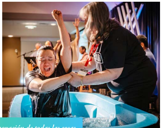
Uniéndonos a Jesús en la renovación de todas las cosas