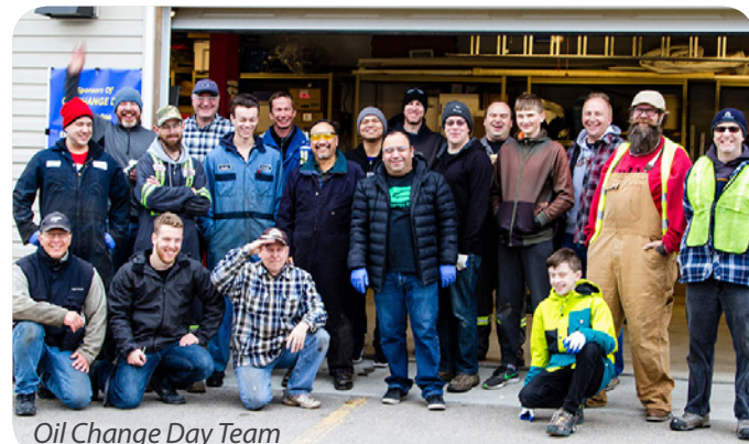
Oil Change Day Team