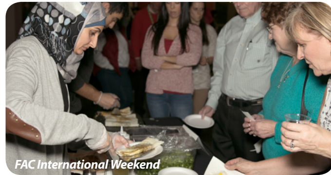
FAC International Weekend