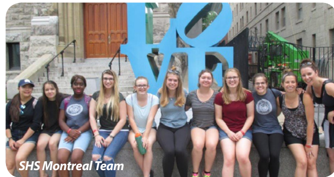
SHS Montreal Team